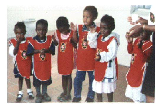
Some of the children from Blessed Gérard's Pre-primary School and Crèche dancing and singing.

All our Associate members were invited to celebrate St. John's Feast on the Saturday prior to the actual feast, with a festive Holy Mass followed by some entertainment by the students of Blessed Gérard's Community Development Centre and Blessed Gérard's Pre-primary School and Crèche.