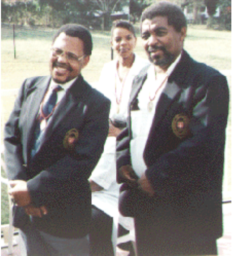
The students from Blessed Gérard's Community Development Centre (sewing school) and their families, modelling some of the clothes which they have sewn during their course.