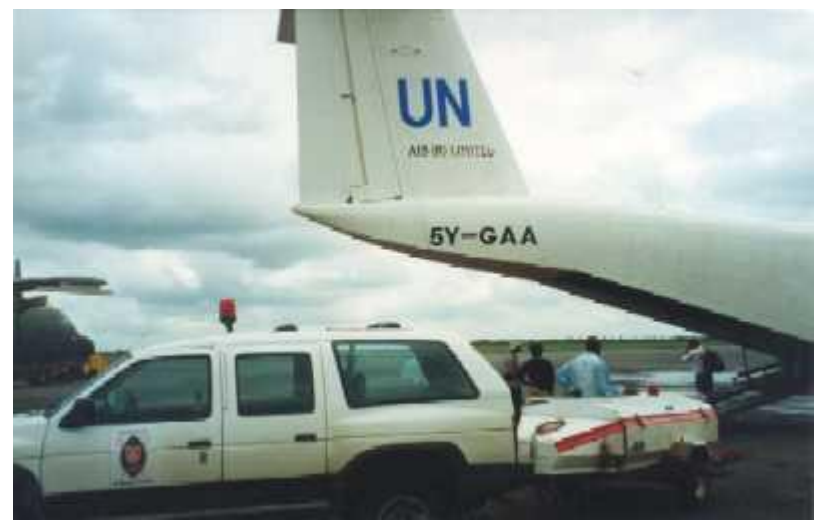
Loading of the relief goods into an UN airplane