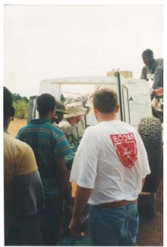
A truck from the Austrian army transported the relief goods to the camp