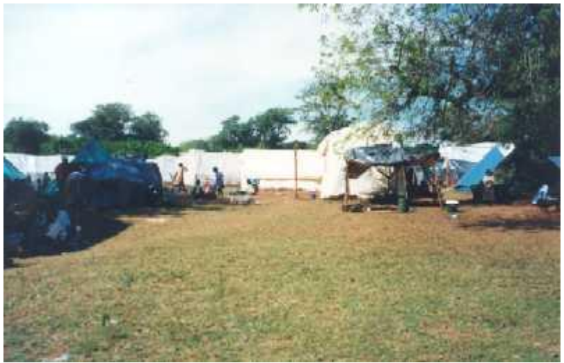
Displaced people found shelter in tents