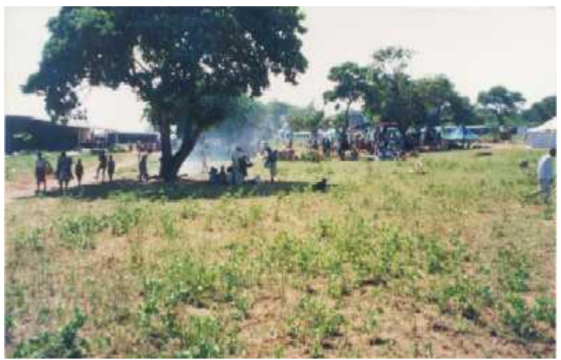
or just in the shade of a tree