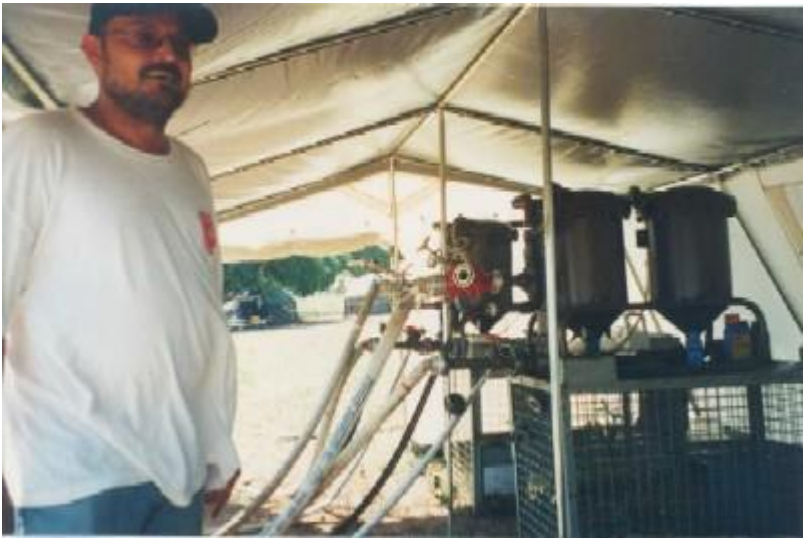
The Austrian army took over the water purification