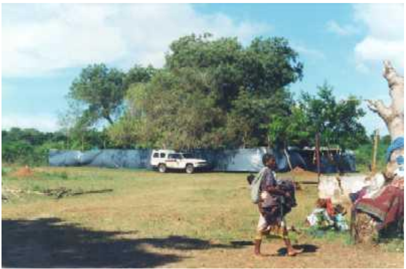
The ECOM took over this field "hospital" in the Chibuto refugee camp