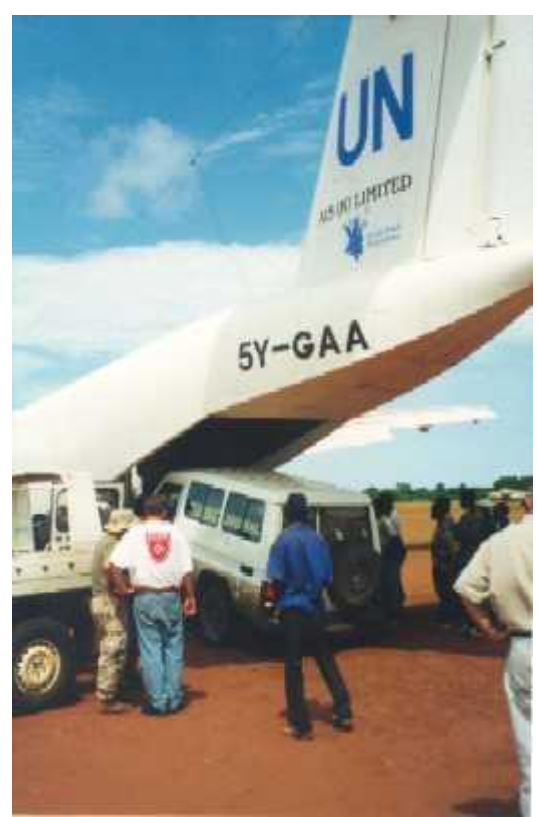
Unloading at Chibuto airstrip