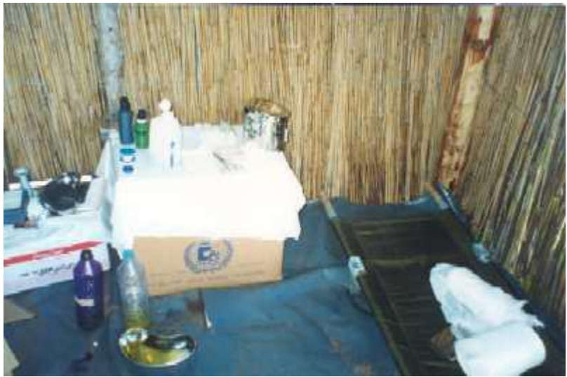
in the "treatment room"