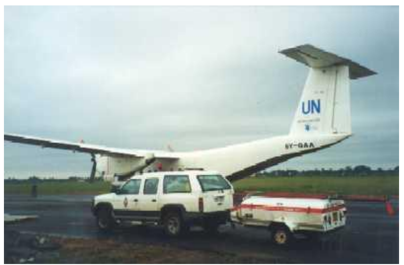
Arrival at Maputo airport with tents, field beds, tables, chairs, medicine boxes and administrative equipment