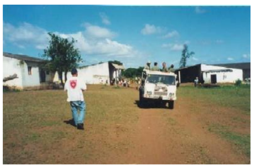
unused buildings of a former farm