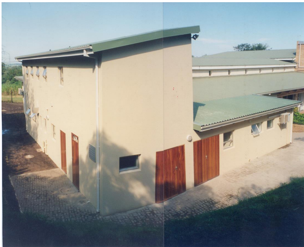
The new wing of Blessed Gérard's Care Centre and Hospice

The ever rising number of patients who seek care at Blessed Gérard's Care Centre and Hospice has made it necessary to extend the building by adding a High-Care-Ward, a change room for the care givers, another store room, a refuse room and a gardener's store room and extending the scullery, pantry, sluice room, laundry and mortuary. The first floor of the new wing houses Blessed Gérard's Community Development Centre, i.e. the Sewing School, which was transferred from St. Anthony's Parish Hall next door.