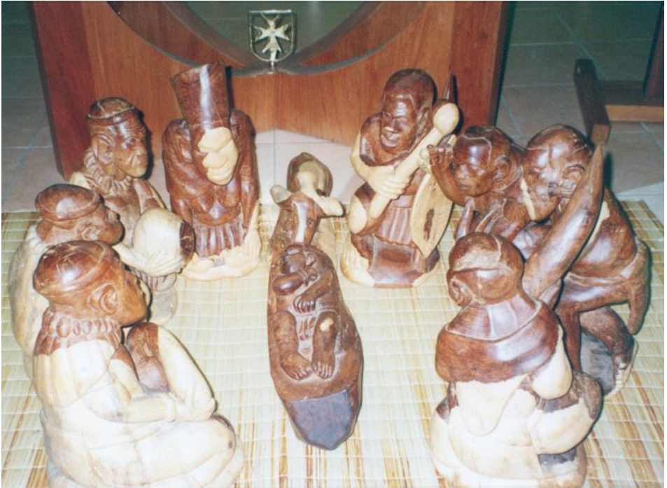
Zulu Nativity Scene at Blessed Gérard's Church in Mandeni

We wish you God's grace at Christmas and for the New Year 2001