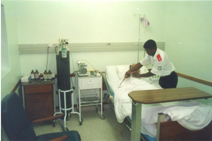
The new High-Care-Ward in Blessed Gerard's Hospice

Blessed Gérard's Care Centre and Hospice has been the one and only hospice on the entire KwaZulu/Natal North coast with an inpatient unit and cared for patients from as far as Matubatuba, Ladysmith, Melmoth or Ballito. It works closely together with the local clinics and doctors, the hospices in Empangeni and Durban and the Cancer Association.