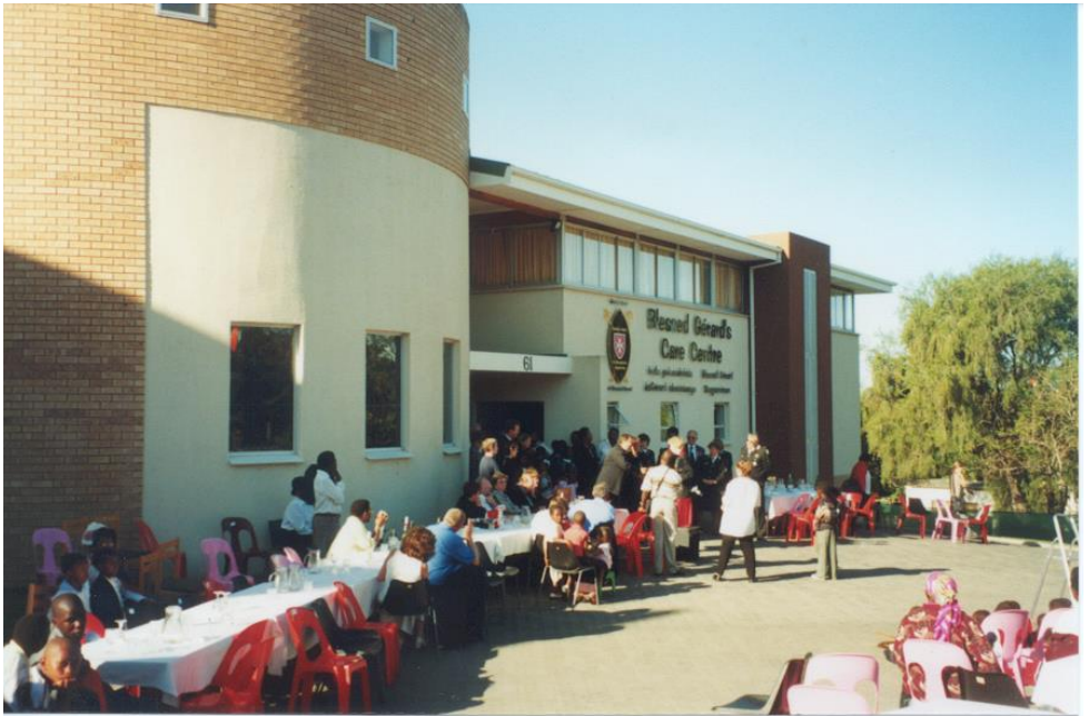
Following the celebrations in Blessed Gérard's Church, which was full to capacity and bursting at the seams, the festivities, with approximately 1500 people, moved outside. Lunch was served and the entertainment began.