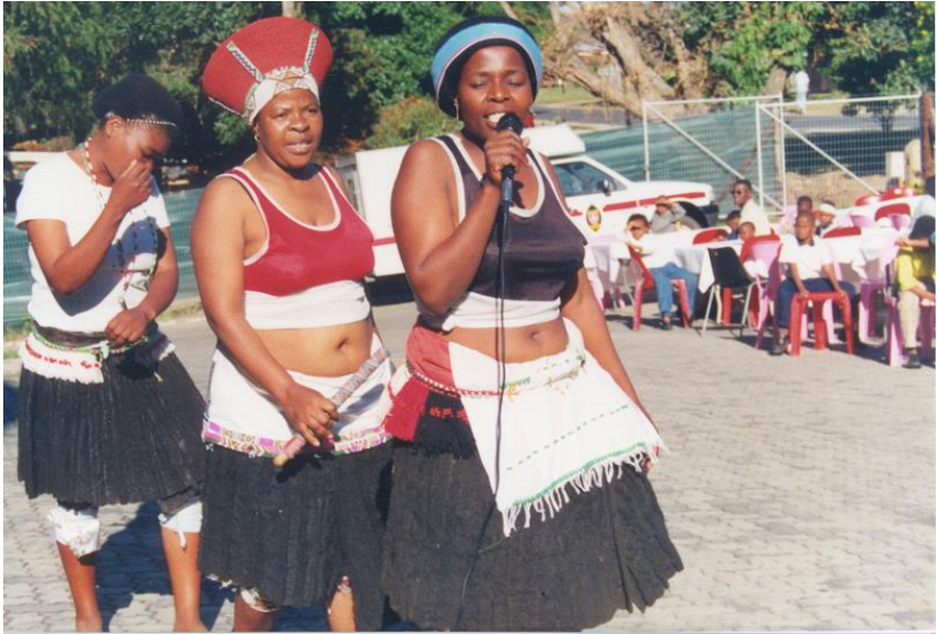
Zulu Dancers, impromptu and independent.