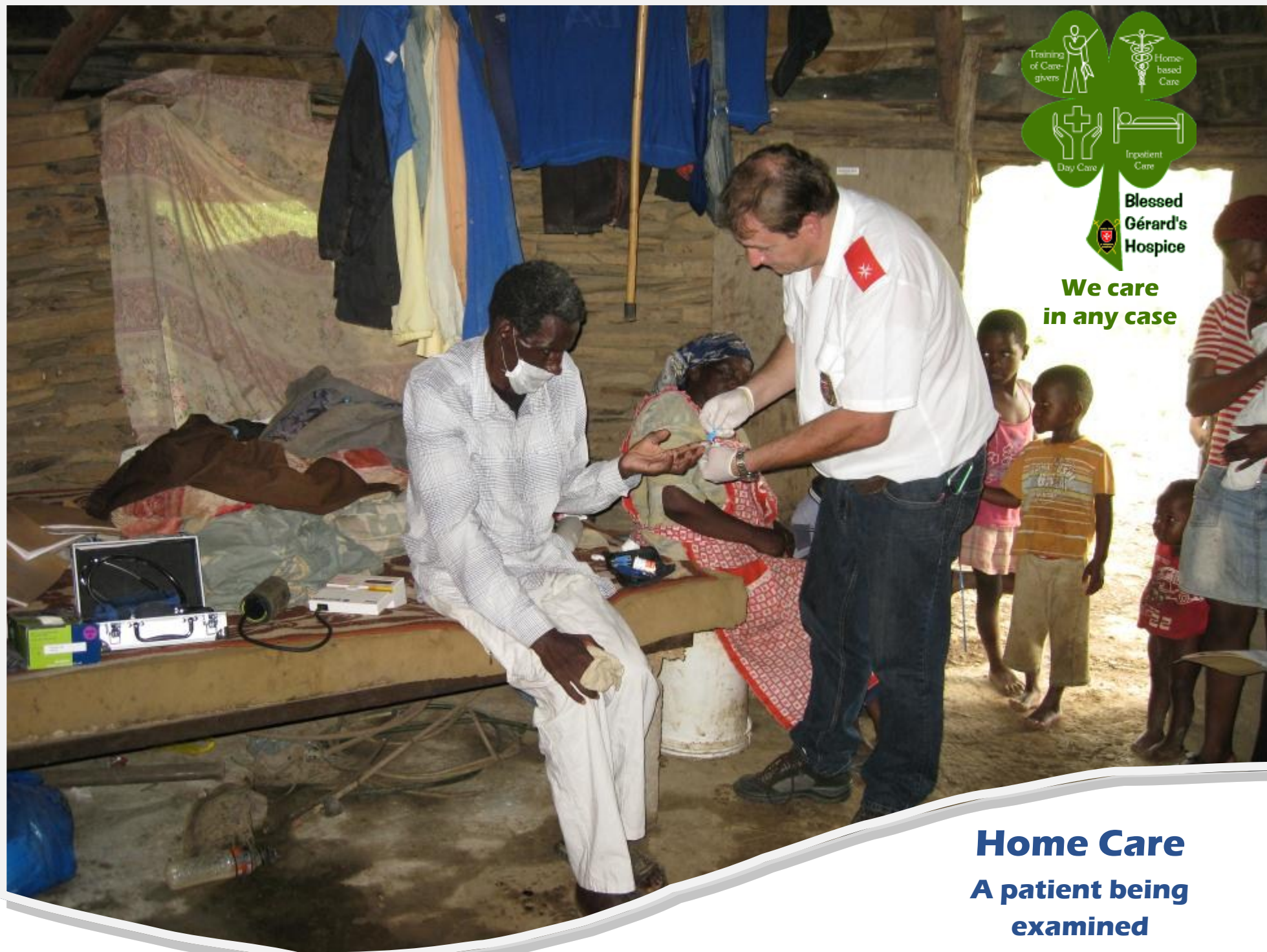
Home Care A patient being examined