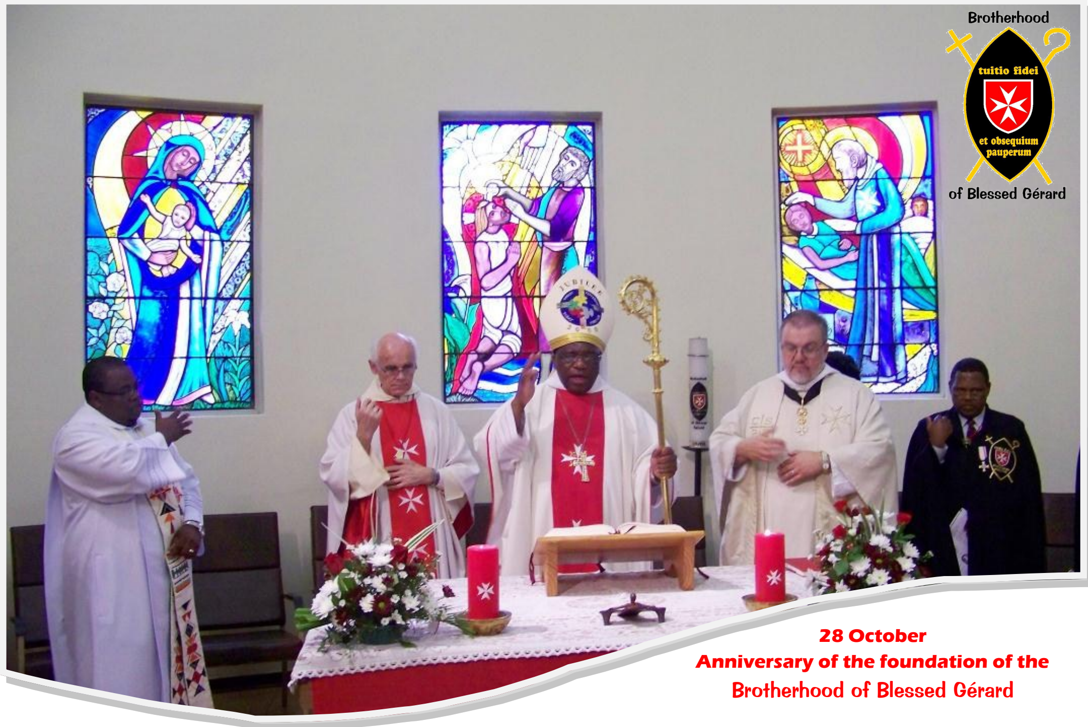
28 October Anniversary of the foundation of the Brotherhood of Blessed Gérard