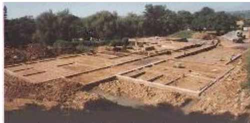
The foundations of Blessed Gérard's Care Centre