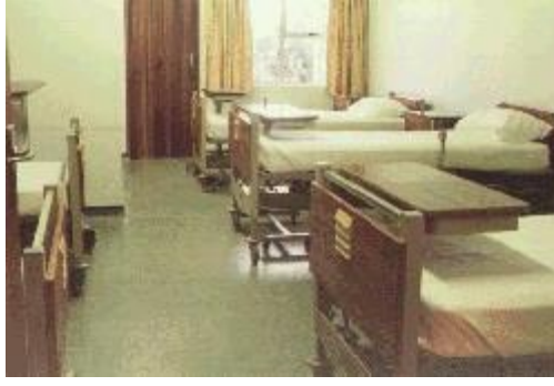
One of the wards