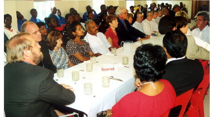
Some of the VIPs who attended the reception.