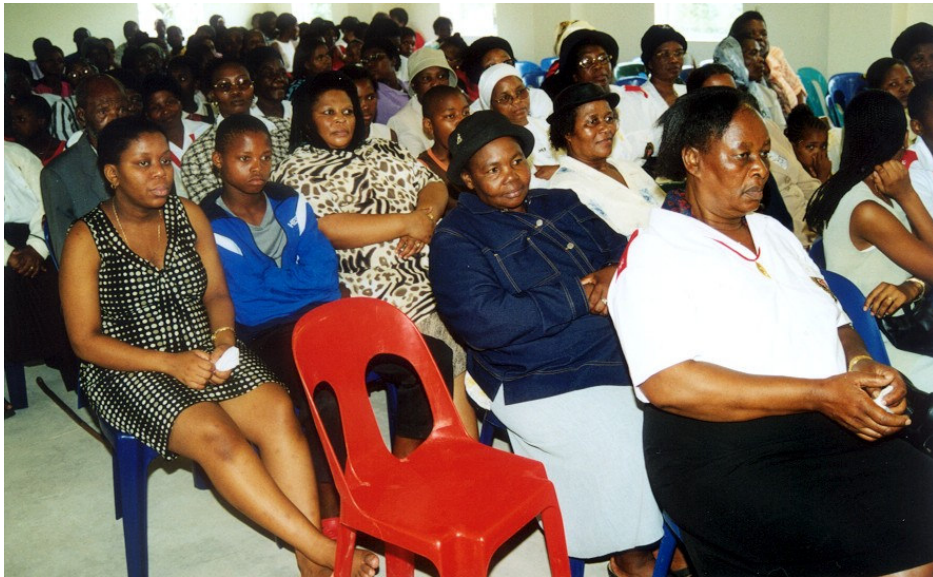
Some of the guests during the function.

Some of the major donors were acknowledged for their valued support: Whirlpool, Nampak, the South African Sugar Association, Loungefurn, SEC Electrical