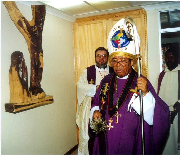
Subsequently Bishop Biyase blessed the new building of Blessed Gérard's Children's Home.