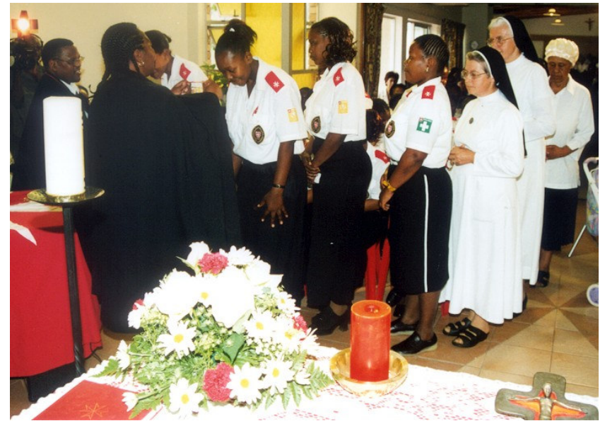
The new members receive the medal of the Brotherhood of Blessed Gérard.