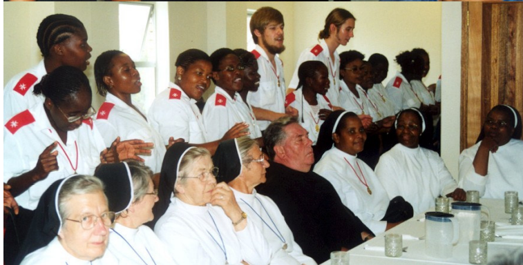
Active members of the Brotherhood of Blessed Gérard expressing their joy and togetherness in song and dance.

The Badge of Honour of the Brotherhood of Blessed Gérard was conferred on: