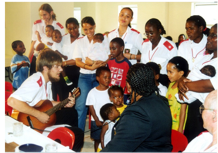
"Thank you for giving me the morning, ... thank you that I can know my worries can be cast on you ... thank you for all my friends and brothers ... thank you for every pleasure small ... thank you for them all!" sung by the children of Blessed Gérard's Children's Home in gratitude.