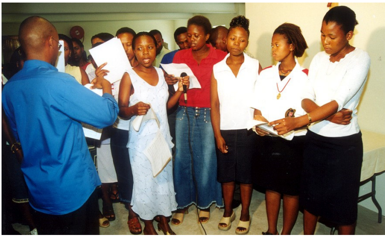
The Sundumbili Youth Choir singing a prayer of blessing for Africa.